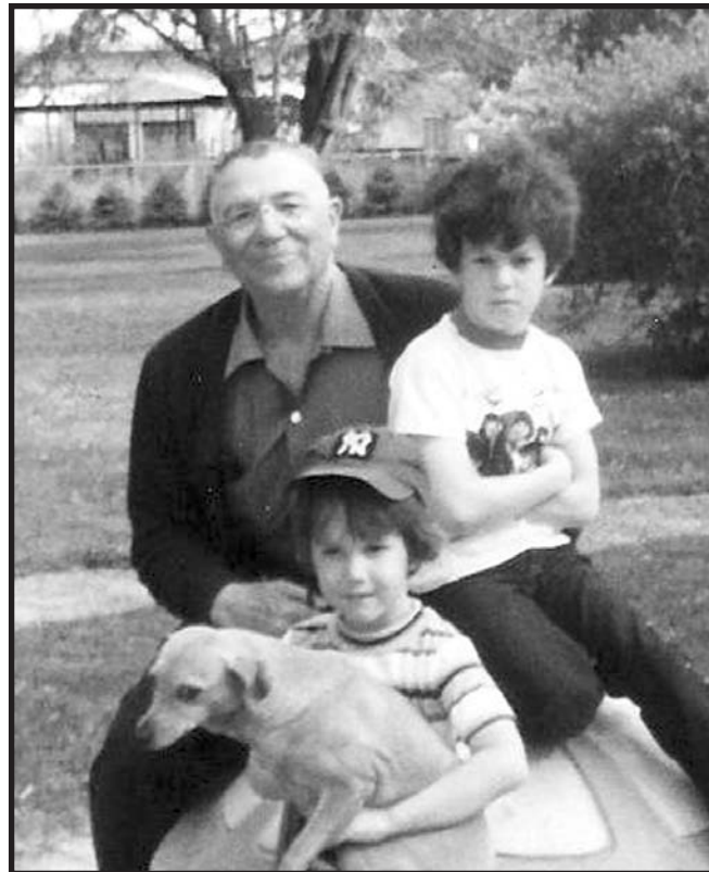
The Original "Brooklyn Boys."