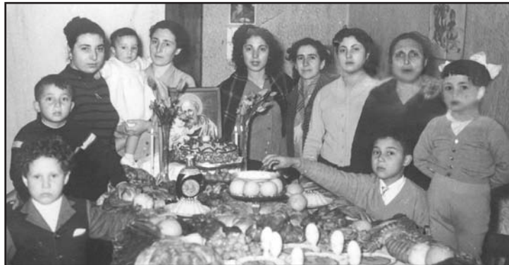
At Brooklyn South... We are family!