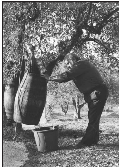
Still, to this day, our family makes their own wines and olive oils.

"Brooklyn South Neighborhood Pizzeria" is a family owned establishment, not a franchise or chain restaurant. We prepare our dough and sauces from our family recipes, and request your kind patience, due to the fact that all our items are prepared fresh when you order them.