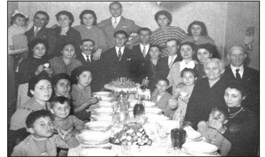
Three Generations... Mangia!